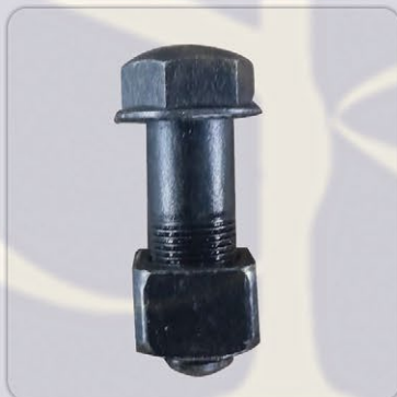
TRACK SHOE PLATE BOLT