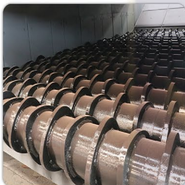
ROLLER SCREEN COUPLING