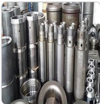
FABRICATED SPARES FOR THERMAL POWER PLANT