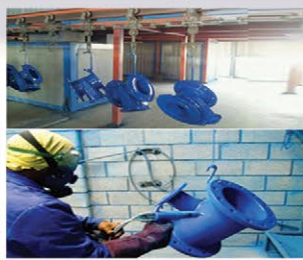
POWDER COATING PLANT