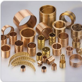
BRONZE BEARING BUSHES