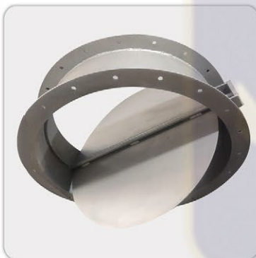
BUTTER FLY DAMPERS