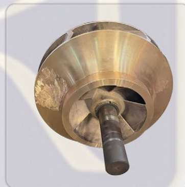
GUN METAL IMPELLER

We introduce ourselves as a Manufacturer & Supplier of CEMENTS PLANT SPARES for RAW MILL, COAL CRUSHER, COAL GRINDING, PRE HEATER, KLIN, COOLER, CEMENTS MILL, COAL MILL, BUCKET ELEVATOR, SCRAPER, EOT CRANES, STRACKER & RECLAIMER, CHAIN & BELT CONVEYOR, GEARS, SPROCKETS, SHAFTING, COUPLING, MILL BOLTS, NIB HEAD BOLTS, 'T'HEAD BOLTS ETC.